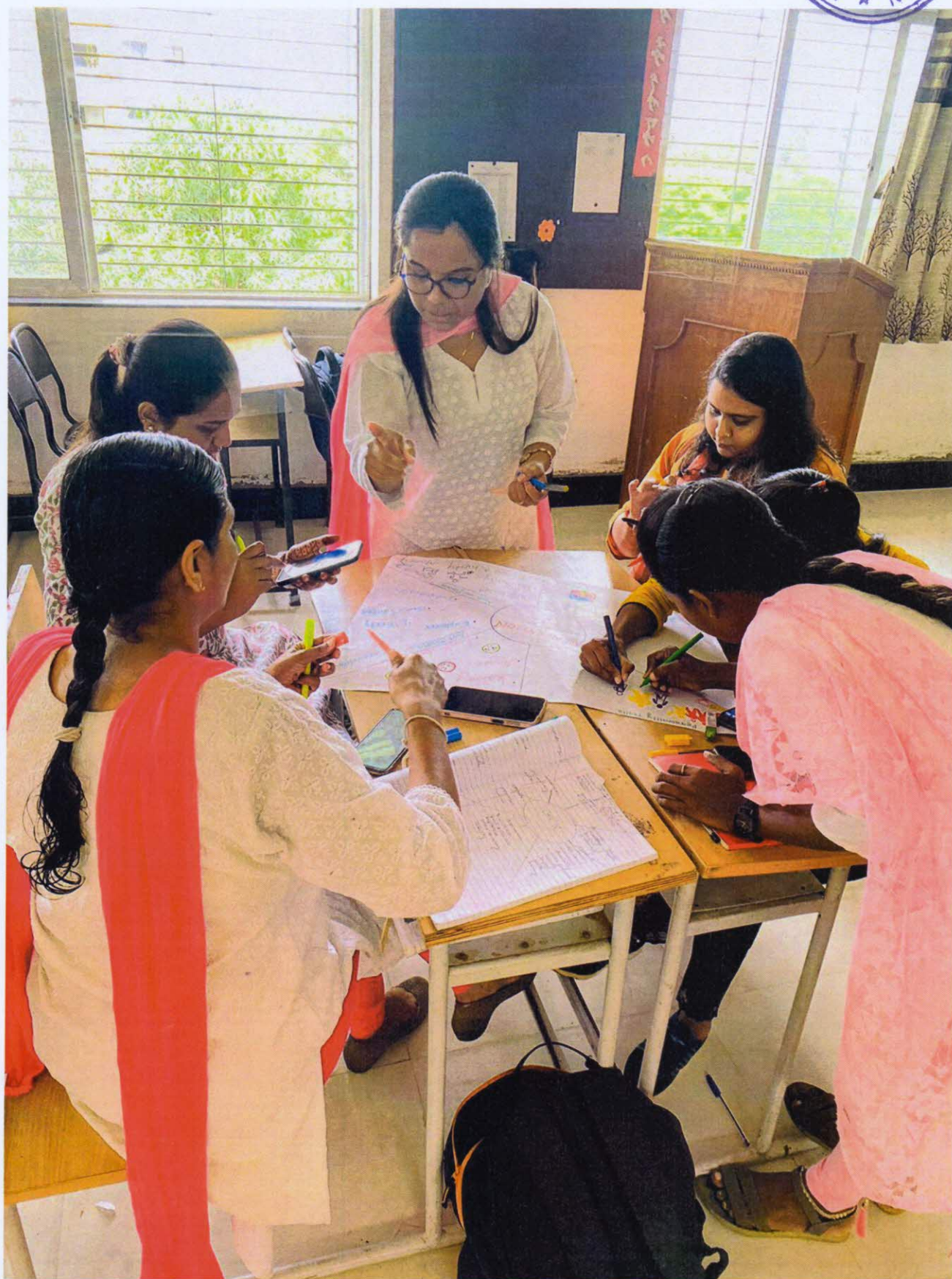
Activities Conducted S.Y.B.Ed student teachers. Dated 17/09/2023