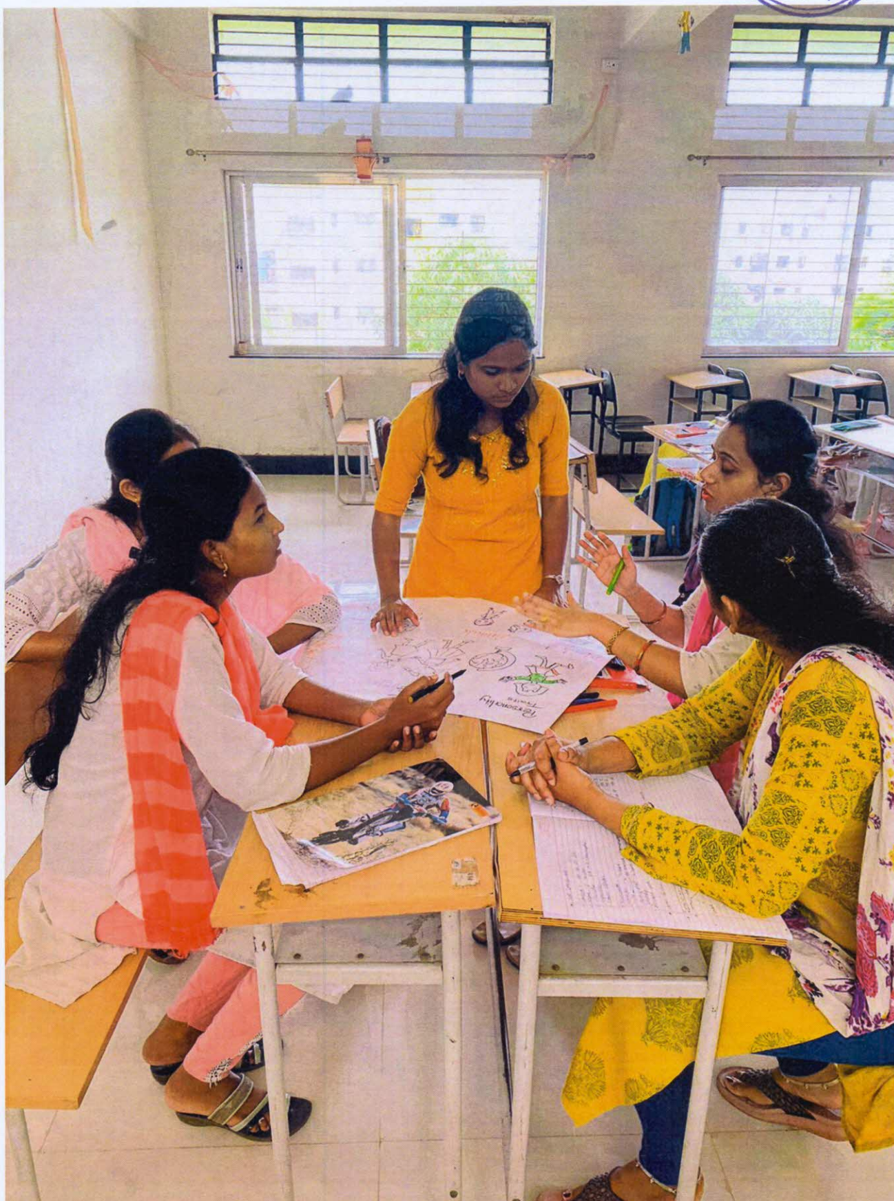
Activities Conducted S.Y.B.Ed student teachers. Dated 17/09/2023